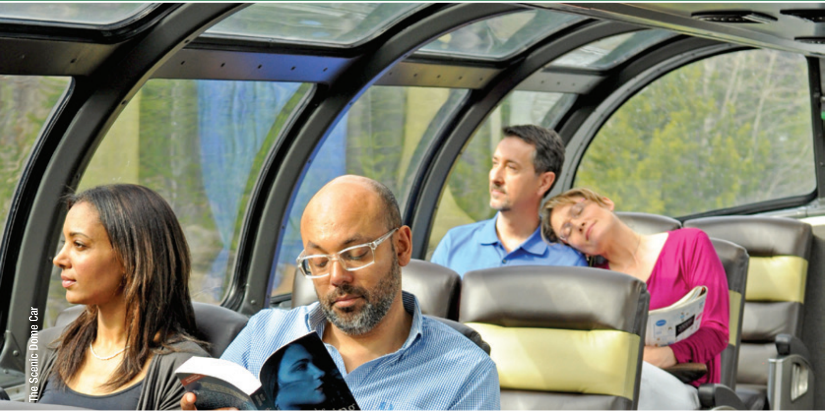
The Scenic Dome Car