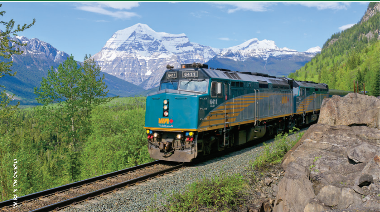
VIA Rail's The Canadian

HIGHLIGHTS: British Columbia • Vancouver • VIA Rail • Jasper • Columbia Icefield • Lake Louise • Banff • Calgary